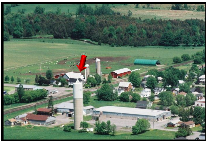
The Finch Drinking Water System

The village of Finch is located approximately 70 km southeast of Ottawa in North Stormont Township. The Finch drinking water system is owned by the Township of North Stormont and operated by the Ontario Clean Water Agency (OCWA). The well field contains 2 wells and serves a population of approximately 440 residents.