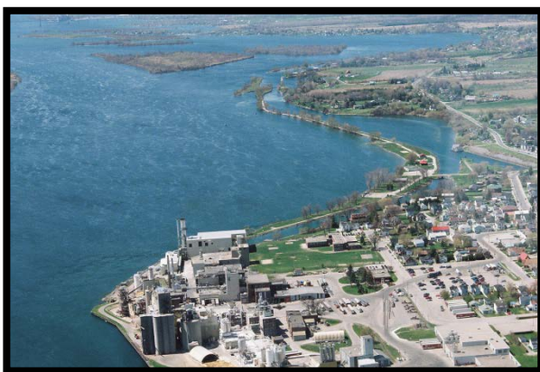
Cardinal Intake Area

The Village of Cardinal municipal water intake is located 55 meters south west of the water treatment plant, approximately 43 meters from the edge of the St. Lawrence River. Raw water is drawn from approximately 5.2 m off the river bottom. The Cardinal Water Treatment Plant is operated by the Township of Edwardsburgh/Cardinal. The Cardinal municipal drinking water system services approximately 1,650 residents.