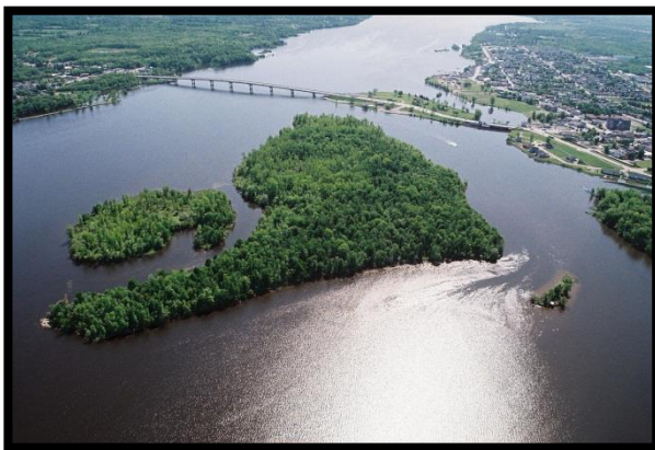
Hawkesbury Intake located on the Ottawa River

The town of Hawkesbury is situated on the shores of the Ottawa River, about 75 kilometres east of the city of Ottawa and across the river from the province of Québec. The Hawkesbury Water Treatment Plant is owned and operated by the Town of Hawkesbury and is located at 670 Main St. West. The intake is located 40 m from shore, at a depth of approximately 4.5 m, below the normal water level of the Ottawa River. This municipal drinking water system provides drinking water to approximately 14,154 residents and along with Hawkesbury also services the communities of L'Orignal, Vankleek Hill and Laurentian Park.