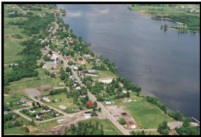
Lefaire Intake (Ottawa River)

Owned by the Township of Alfred-Plantagenet and operated by the Ontario Clean Water Agency (OCWA), the Lefaire Water Treatment Plant draws its water from the Ottawa River. The intake is located in Lefaire, north of the Lefaire Water Treatment Plant, approximately 90 m off shore at a depth of 15 m. The system serves a population of approximately 4,500 residents and also includes the municipalities of Alfred, Plantagenet and St. Isidore. This drinking water system is one of 13 systems that draw water from surface water in the form of rivers or lakes in the Raisin-South Nation Source Protection Region.