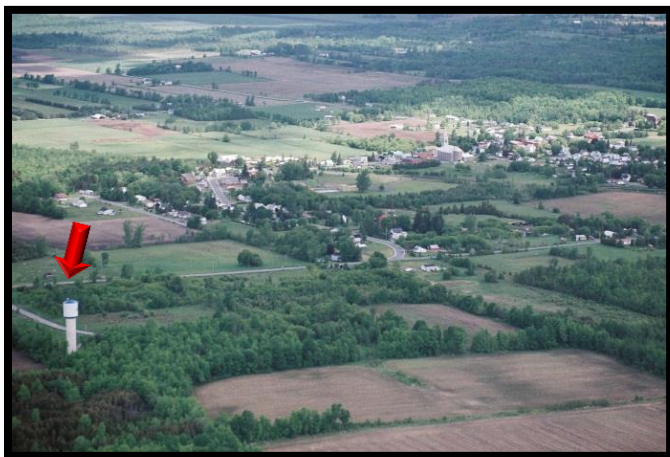
The Moose Creek Water Supply

The village of Moose Creek is located approximately 80 km southeast of Ottawa in the North Stormont Township. The Moose Creek drinking water system is owned by the Township of North Stormont and operated by the Ontario Clean Water Agency (OCWA). The well field contains 3 wells and serves a population of approximately 300 residents.