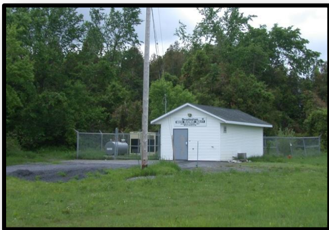
Drinking Well Supply, Newington

The village of Newington is located approximately 25 km northeast of Cornwall in the South Stormont Township. The Newington Well Supply is owned by the Township of South Stormont and operated by Caneau Water and Sewage Operations Inc. The Newington Well Supply contains 2 wells and serves a population of approximately 260 residents.