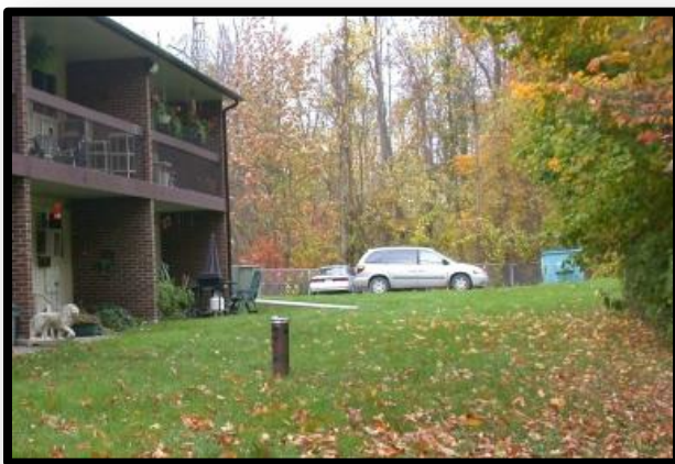
Wellhead, Bennett St., Spencerville

The village of Spencerville is located approximately 75 km south of Ottawa. Within the Village a groundwater supply system provides water to one 15-unit apartment building located on Bennett St. in Spencerville. The groundwater supply is made up of one groundwater well. Commonly referred to as the Bennett St. well, this drinking water system is owned by the United Counties of Leeds and Grenville and operated by Edwardsburgh/Cardinal Environmental Services.