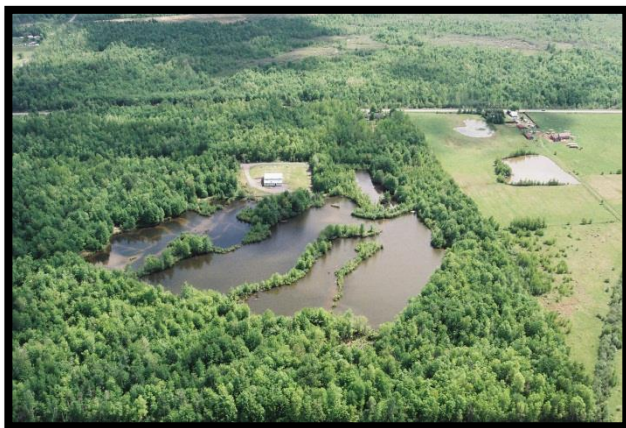
The Vars Wellhead

The village of Vars is located in the eastern portion of the City of Ottawa. Owned and operated by the city of Ottawa, the two wells serve a population of approximately 1,130. The Vars wellheads are located 1.3 km away from the municipal wells that service the village of Limoges. Both systems draw their drinking water supplies from the Vars-Winchester esker aquifer.